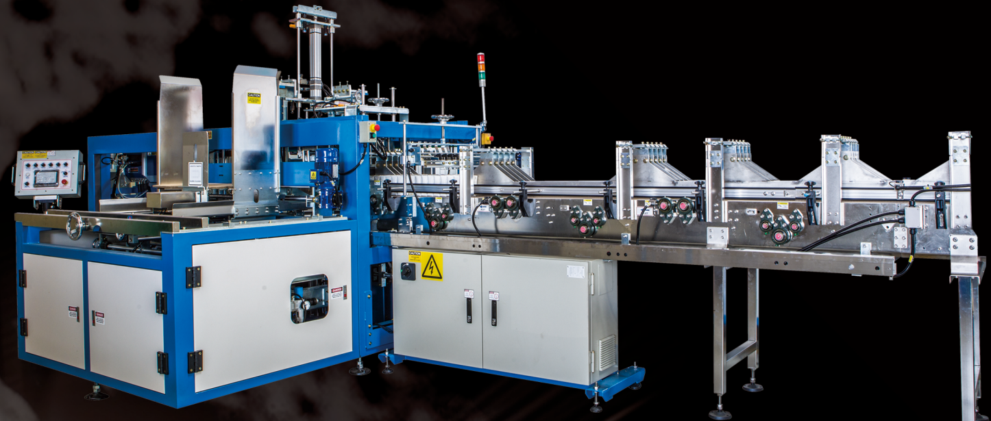
FY-2125-L (PULL TYPE)